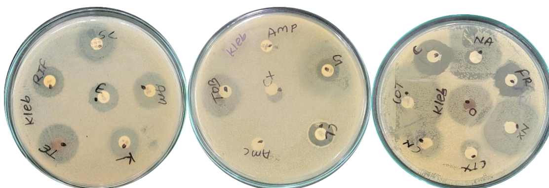
Fig 1. Antibiotic Sensitivity by Disc diffusion Method