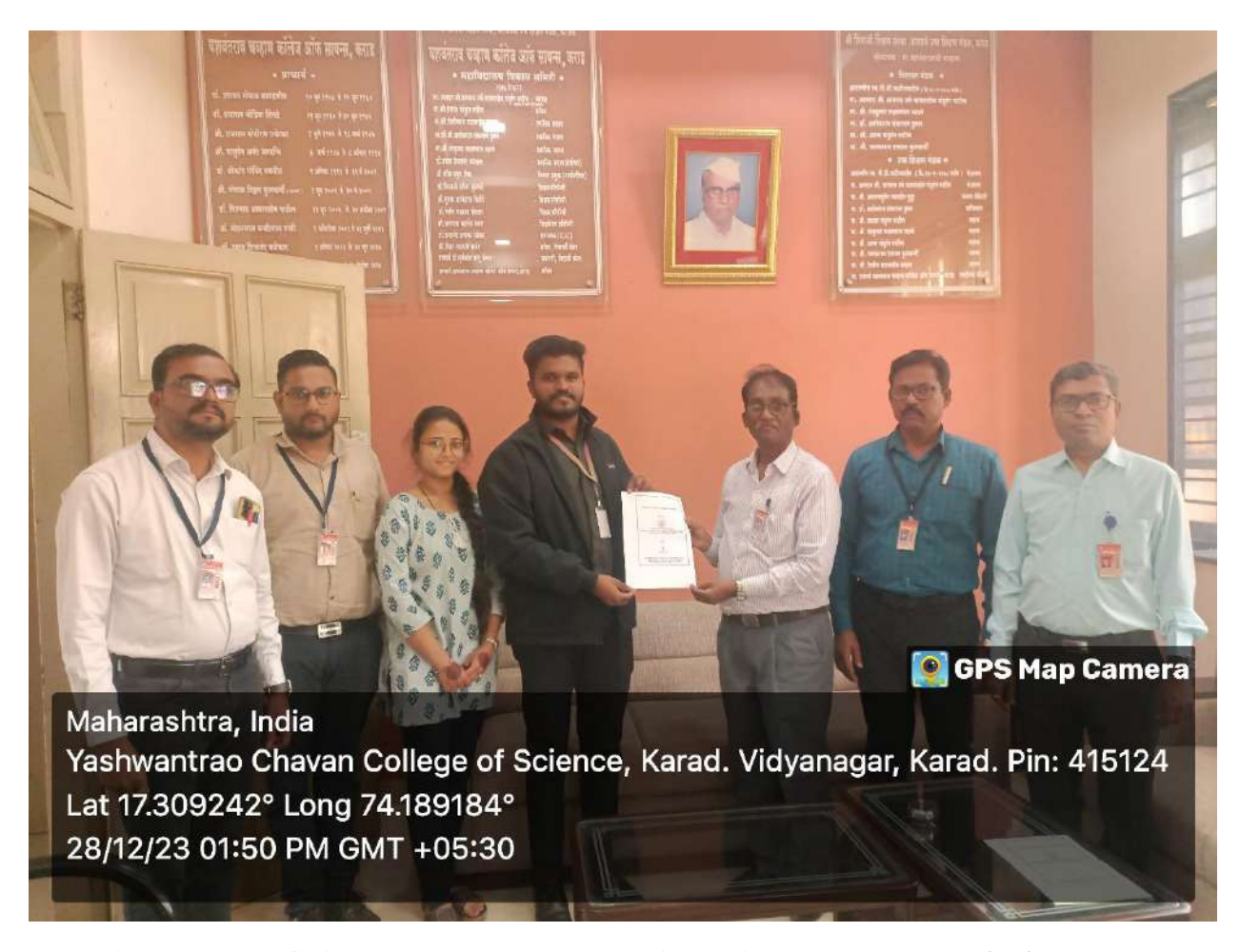
MoU signed with Infinite Biotech Research and Analytics, Pvt. Ltd. on 28/12/2023