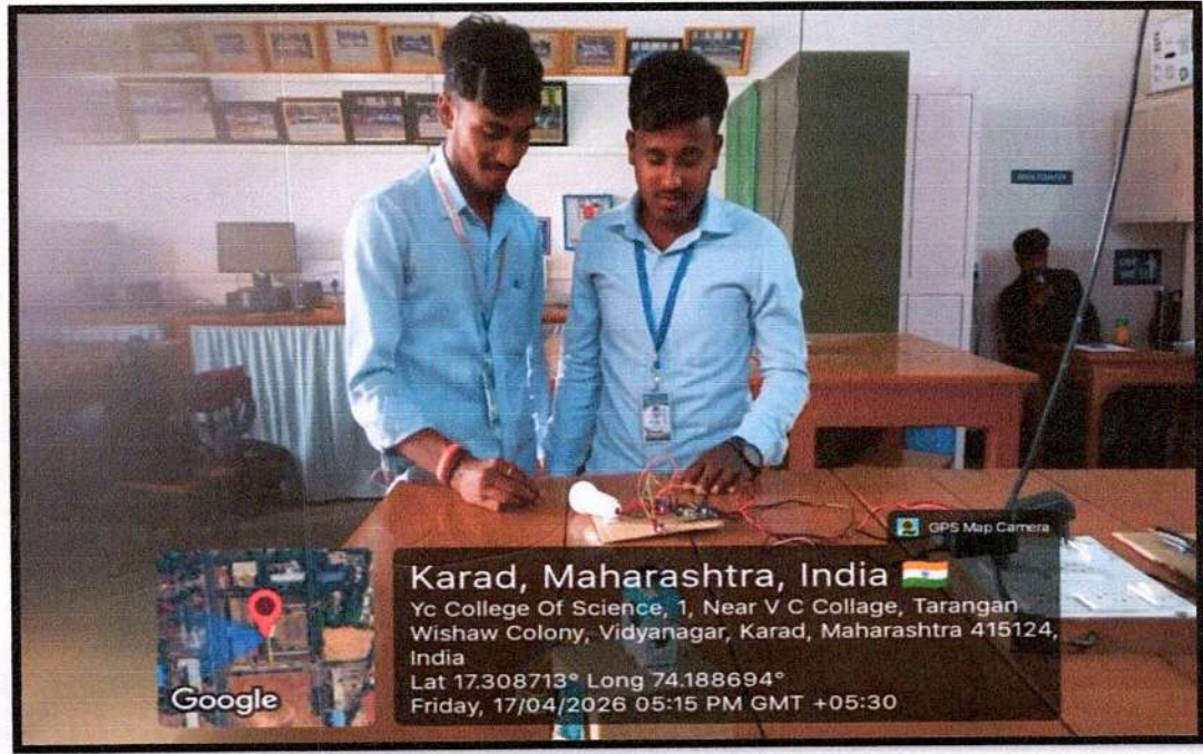
Student explaining the Project