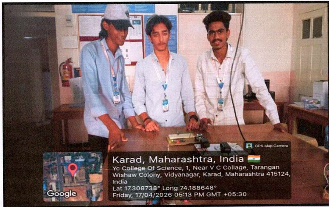
Student explaining the Project