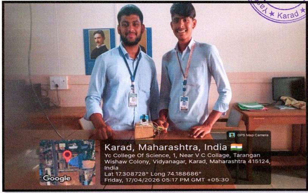
Student explaining the Project