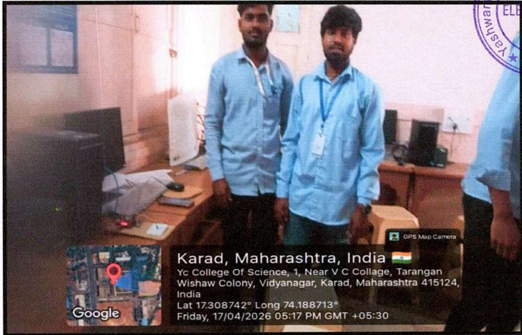
Student explaining the Project